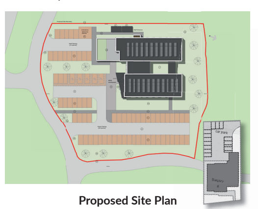
(cut out shows current surgery for size comparison)

We are now seeking feedback and comments from our wider patient group and local community.